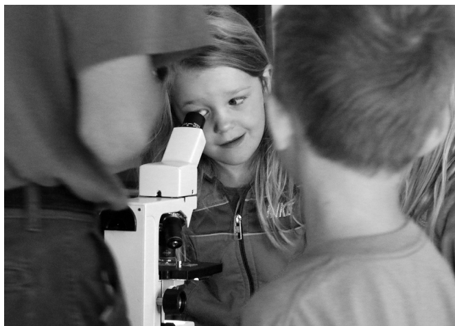
Elementary Schools - continued

As always, Cooper staff continues to build the capacity of all learners, adults and children alike. Several of our staff members have received advanced Master's and Doctorate degrees and many are National Board Certified Teachers. This exemplifies our commitment to lifelong learning. We are reminded daily of our role in preparing our students for their future. Thank you for sharing your cherished sons and daughters with us.